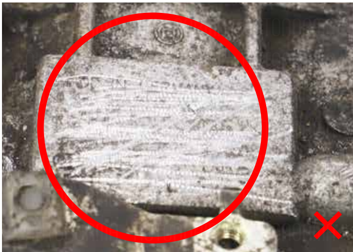
Missing / illegible labeling