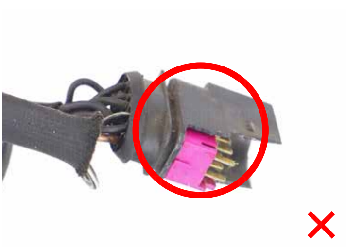
Damaged cables / control unit