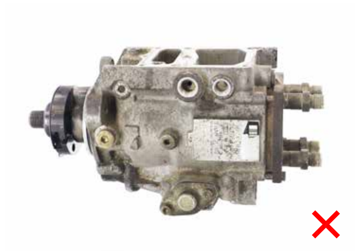
Disassembled / incomplete part