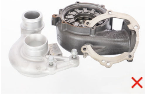
Disassembled / incomplete part