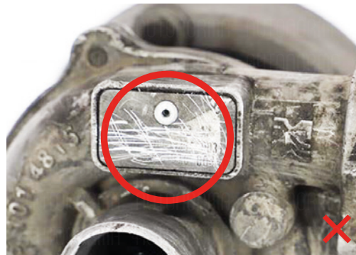
Missing / illegible labeling