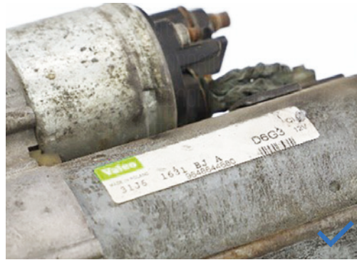
Fully legible labeling