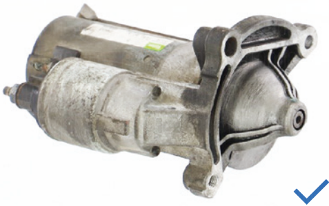
Undamaged part, complete without any missing components