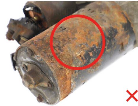
Missing / illegible labeling