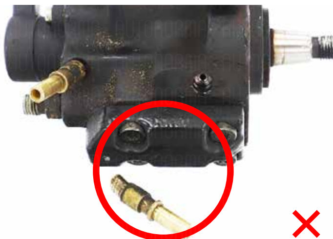
Damaged fuel supply