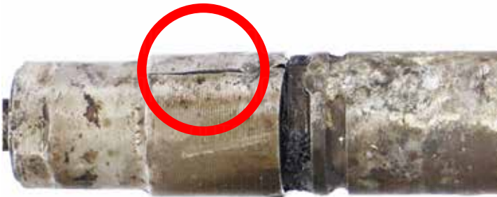
Heavily damaged / cracked body