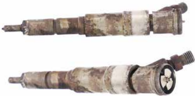
Disassembled / incomplete part