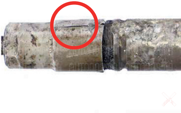
Heavily damaged / cracked body