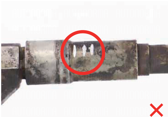
Notches / incisions on the body